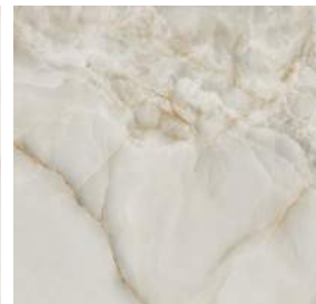
LIGHT GREY FLOONLG