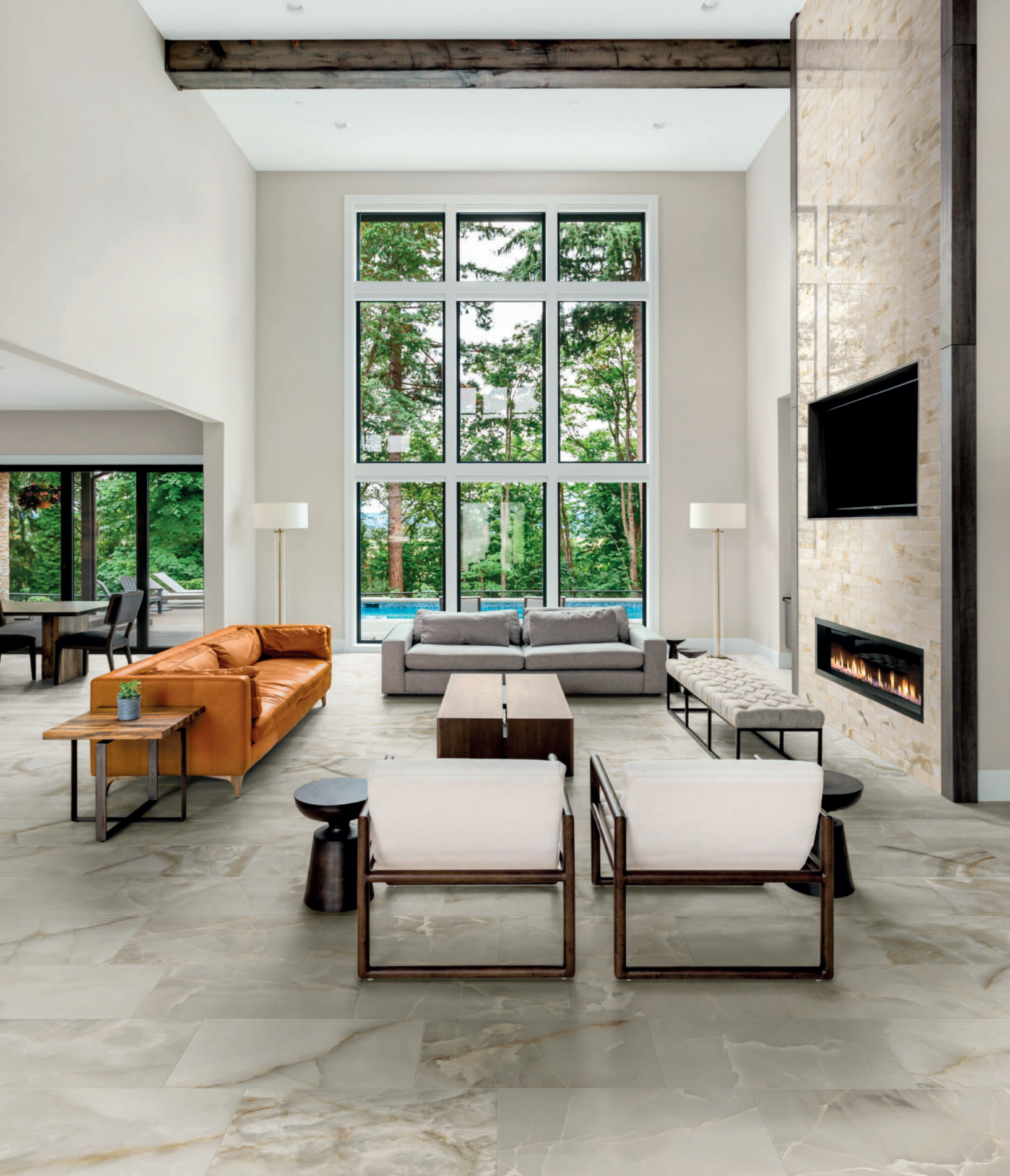
Photo features Onyx Light Grey Matte 12 x 24 & Ivory Polished 3 x 6 Brick.