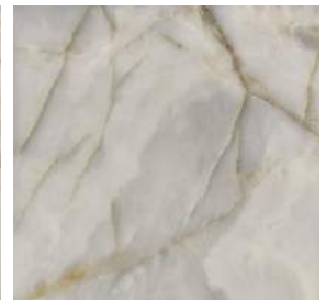
DARK GREY FLOONDG