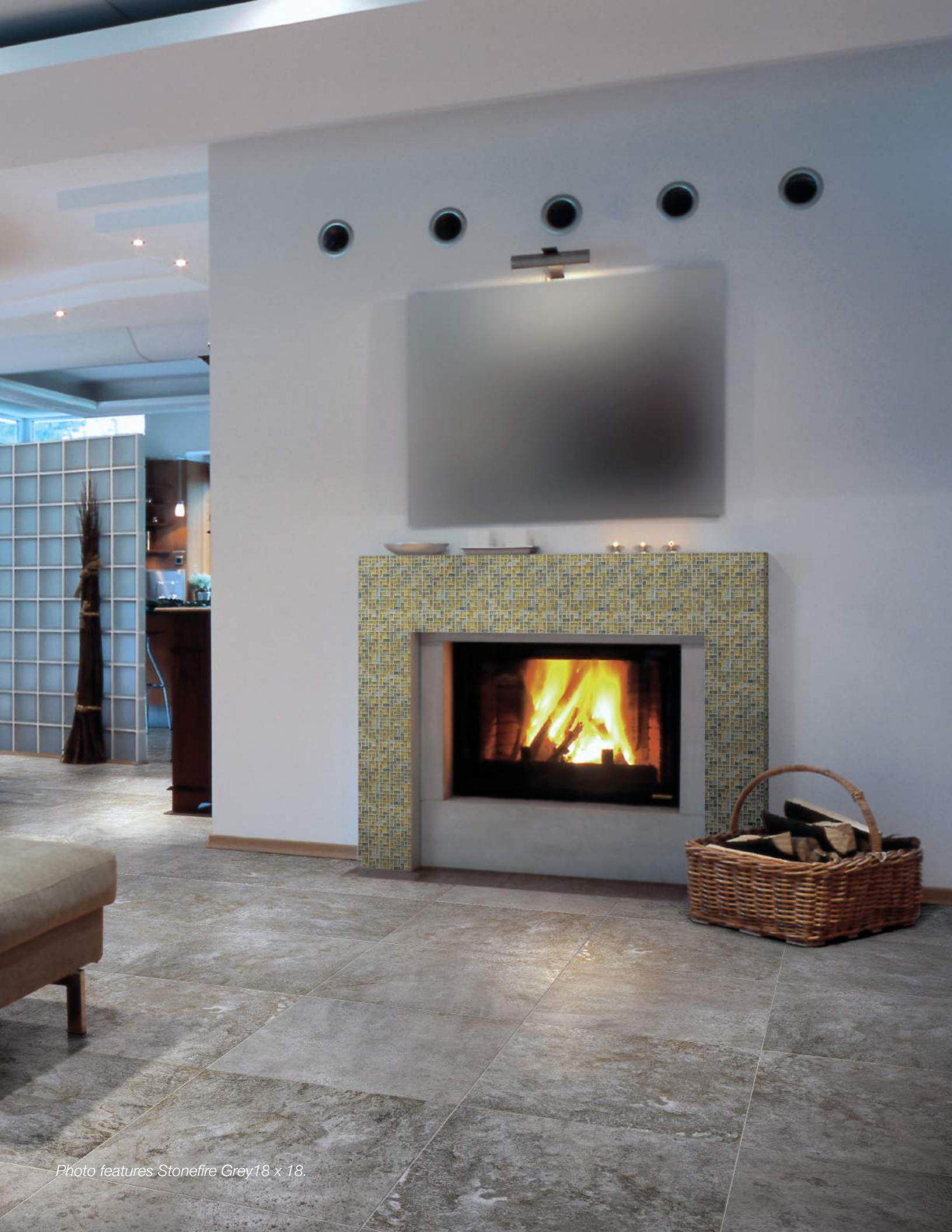
Photo features Stonefire Grey 18 x 18.