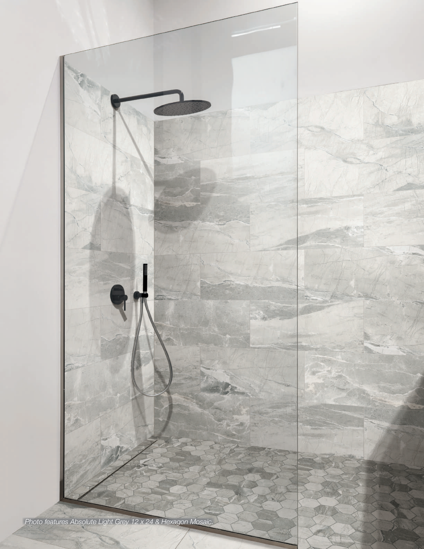
Photo features Absolute Light Grey 12 x 24 & Hexagon Mosaic.