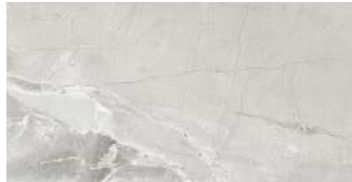
LIGHT GREY FLOABLQ