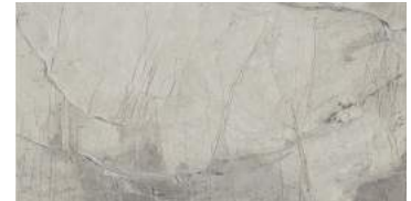
DARK GREY FLOABDG